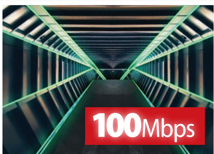
Fast 100Mbps PoE+ Device Ports