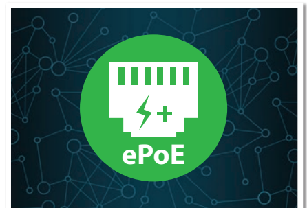
Extended PoE Range up to 800m