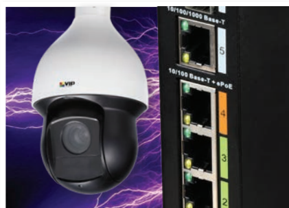
Hi-PoE Support for 60W Devices